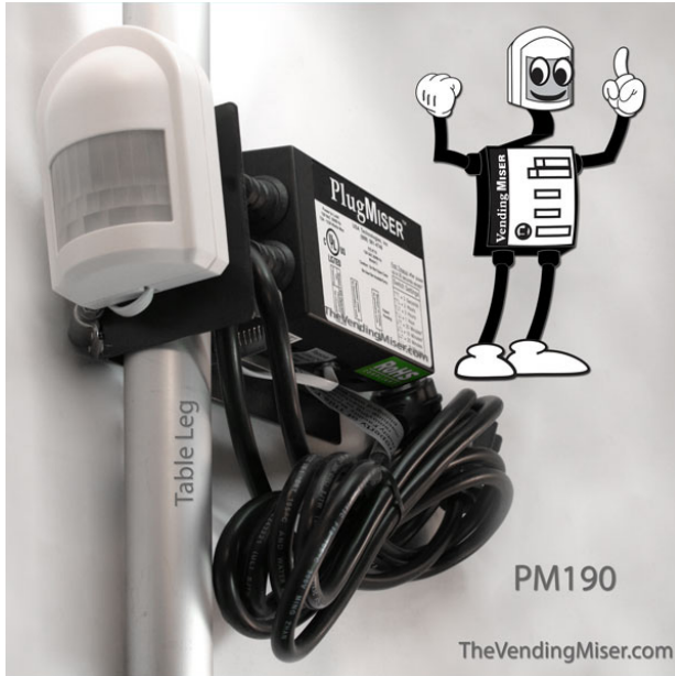
PM190 (shown mounted on table leg)