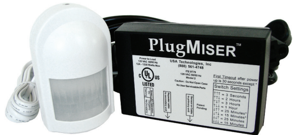
PM150 (wall mount)

Keeping equipment powered off when not needed can prolong the lifespan of the equipment and save hundreds of dollars in energy costs each year.