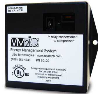
VM2iQ Internal Unit

Equipped with the VM2iQ, refrigerated beverage vending machines use less energy and are comparable in daily energy performance to newer Energy Star® qualified machines.